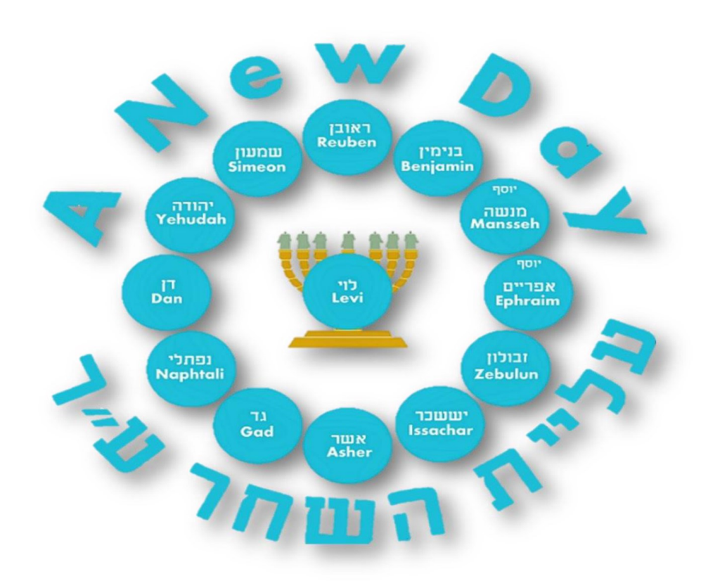
One Family, One Nation משפחה אחת, עם אחד